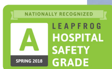
Saint Joseph Medical Center

St. Joseph Medical Center and St. Mary's Medical Center are part of the Blue Cross Blue Shield network and follow the moral teaching of the Catholic Church. St. Joseph Medical Center was one of 750 hospitals awarded an 'A' for its efforts in protecting patients from harm and meeting the highest safety standards in the US. Employees covered under the Blue Cross Blue Shield plan (excluding Spira Care), who choose St. Joseph and St. Mary's for medical care will not incur out-of-network expenses. St. Joseph and St. Mary's provide a full spectrum of healthcare services for men, women and children.